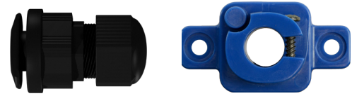
Gland Nut (left) or °C Clamp (right) fitting options available